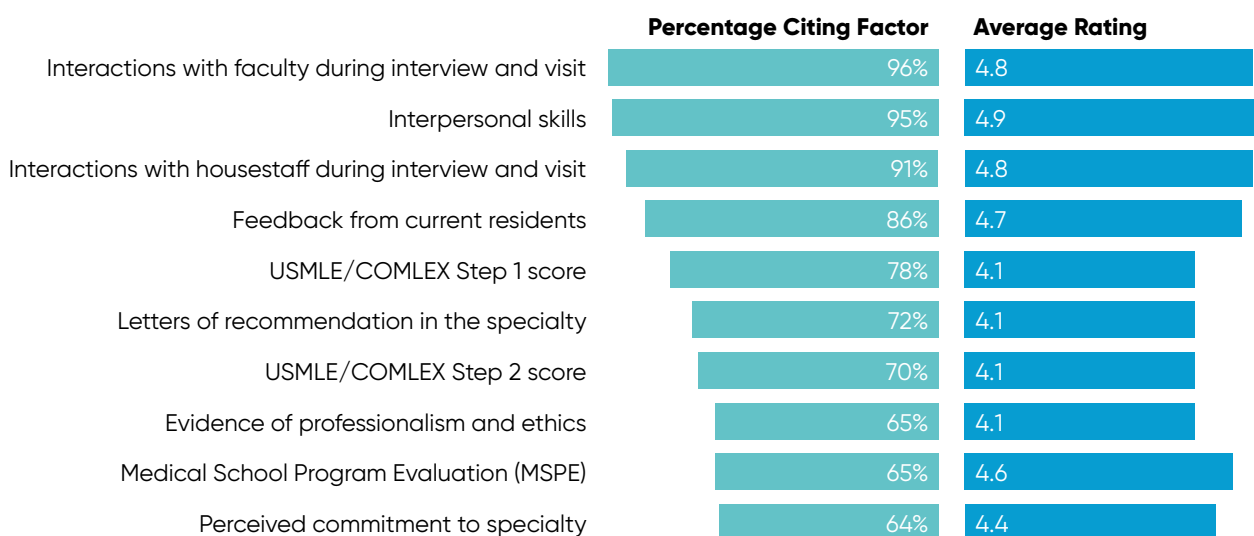
FIGURE 3: National Resident Matching Program, Data Release and Research Committee: Results of the 2018 NRMP Program Director Survey. National Residency Matching Program, Washington, DC. 2018.